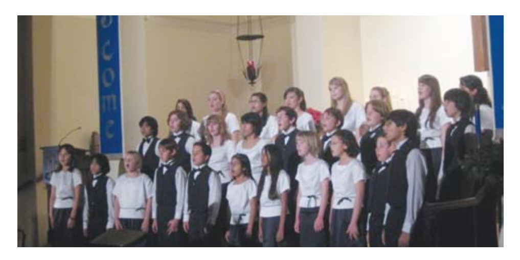
The Colburn Children's Choir performed on December 6 at the First Lutheran Church thanks to VNC funding for the concert series.

panied by the beginning of a new community partnership between the VNC and the Masters In The Chapel concert series. On December 6 we were pleased to provide funds for the first of a four concert series featuring the Colburn Children's Choir. Held at the First Lutheran Church the concert featured some of the best young voices of Los Angeles in a joyous selection of multicultural music. There are two remaining concerts in this series — a duet from the Los Angeles Philharmonic on March 26 and eight singers from the Los Angeles Master Chorale performing an a cappella concert of folk, classical and native music