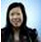
By ANH DO

http://www.latimes.com/local/lanow/la-me-oc-homeless-20180205-story.html