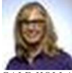
By GALE HOLLAND

http://www.latimes.com/local/lanow/la-me-homeless-how-we-got-here-20180201-story.html