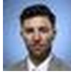
By LIAM DILLON MAR 01, 2018 SACRAMENTO

http://www.latimes.com/politics/la-pol-ca-homeless-housing-bond-stalled-20180301-story.html