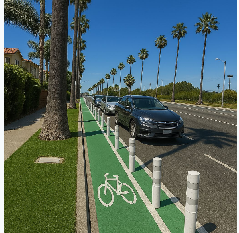
*Image is a mockup and not a final rendering or approved design