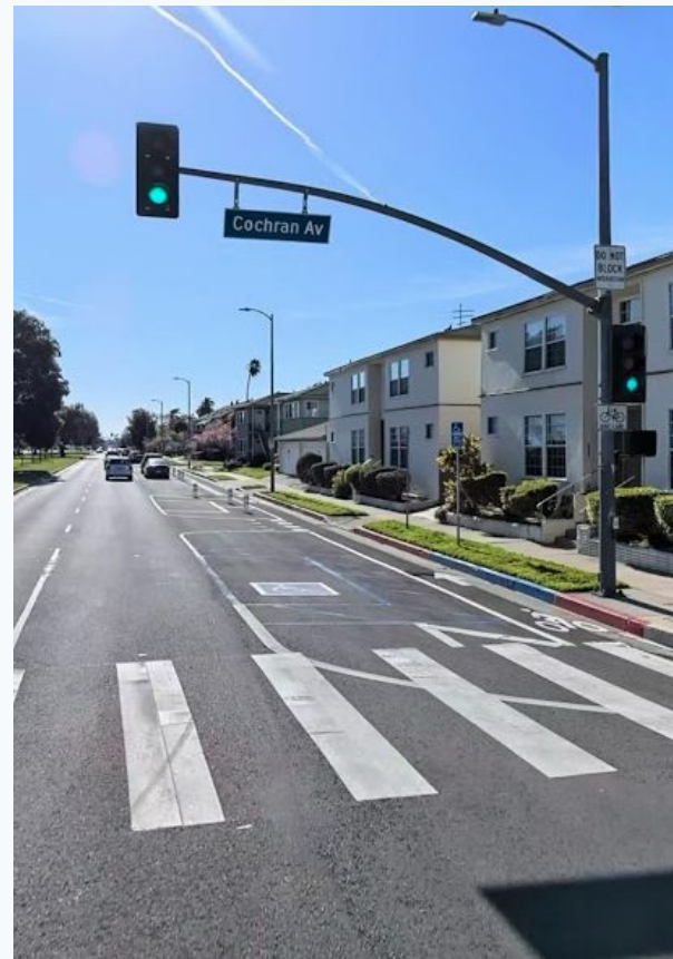
*Example of this at the corner of San Vicente Blvd & S Cochran Ave.