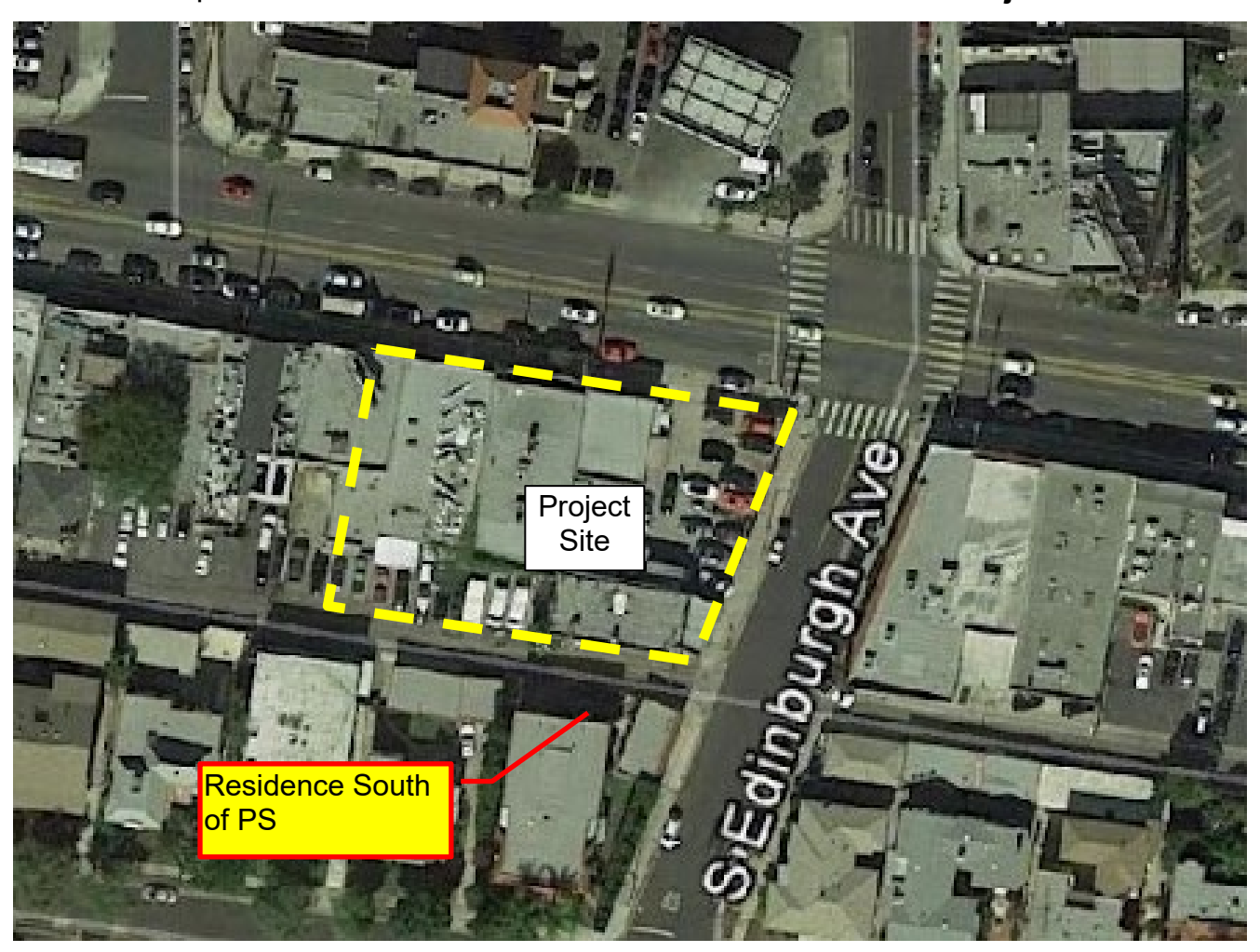
8-Hour Leq Construction Noise Calculations - 8000 W 3rd Street Project MND