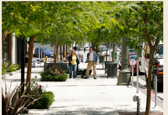
Washington Blvd, Culver City Arts District