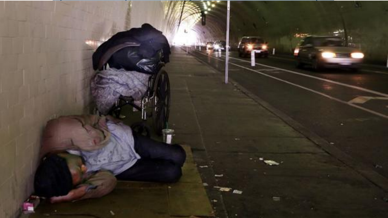
A man sleeps in the 2nd Street tunnel in downtown Los Angeles. Citywide, the homeless population jumped 23% over the last year.

http://www.latimes.com/opinion/editorials/la-ed-grim-2017-homeless-numbers-20170601-story.html