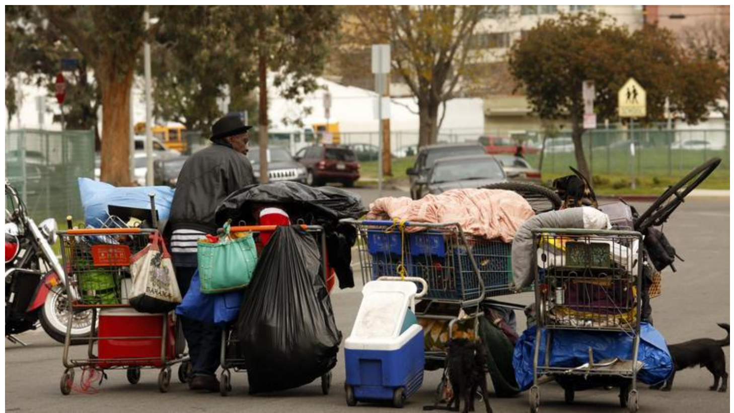
Mirroring last year's count, only one of every four homeless people were classified as "sheltered," meaning they were counted in an emergency shelter or longer-term transitional program. That left three of every four — just under 43,000 — living on the street.

The only hopeful sign of homeless initiatives making headway was the strong increase in the number of homeless families being sheltered. Though the population of homeless families increased nearly 30%, those without shelter dropped 21%.