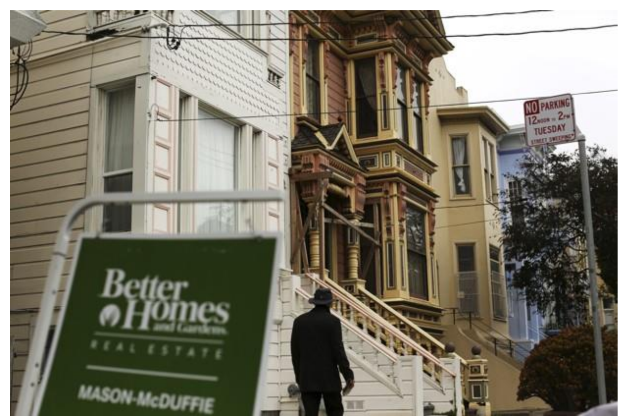
A real state sign is seen near a row of homes in the Haight Ashbury neighborhood in San Francisco.

Regardless of these realities, most San Francisco progressives chose to stick with their familiar stance of opposing new development, positioning themselves as defenders of the city's physical character. Instead of forming a pro-growth coalition with business and labor, most of the San Francisco Left made an enduring alliance with home-owning NIMBYs. It became one of the peculiar features of San Francisco that exclusionary housing politics got labeled "progressive." (Organized labor remained a major political force throughout this time period, and has allied with both pro-growth and anti-growth forces, depending on the issue.) Over the years, these anti-development sentiments were translated into restrictive zoning, the most cumbersome planning and building approval process in the country, and all kinds of laws and rules that make it uniquely difficult, time-consuming, and expensive to add housing in San Francisco.