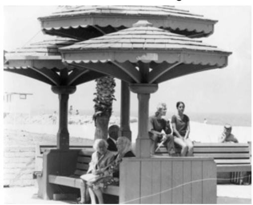
Rec & Parks to repair & maintain shingles, spires and paint