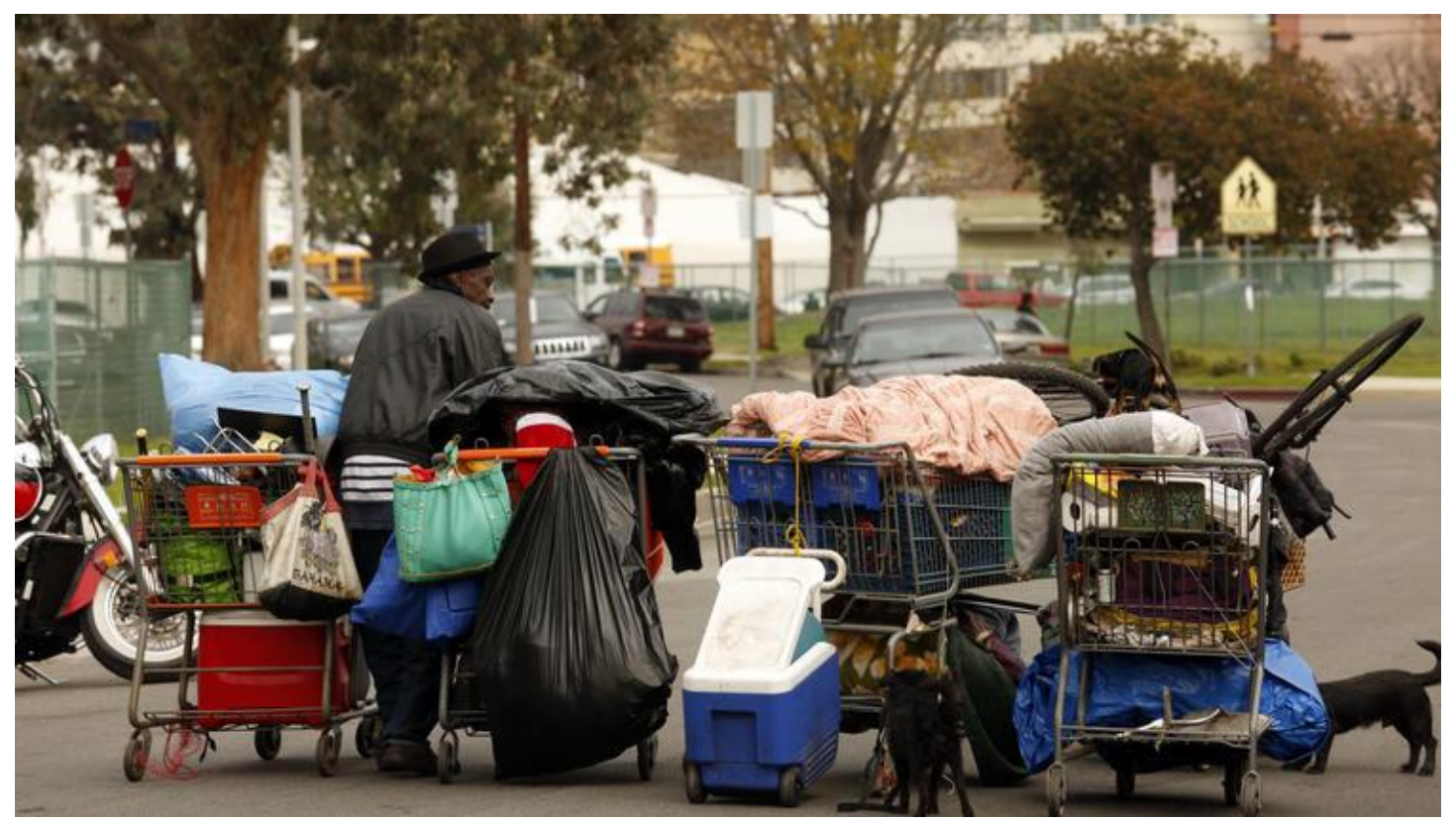
Mirroring last year's count, only one of every four homeless people were classified as "sheltered," meaning they were counted in an emergency shelter or longer-term transitional program. That left three of every four — just under 43,000 — living on the street.

The only hopeful sign of homeless initiatives making headway was the strong increase in the number of homeless families being sheltered. Though the population of homeless families increased nearly 30%, those without shelter dropped 21%.