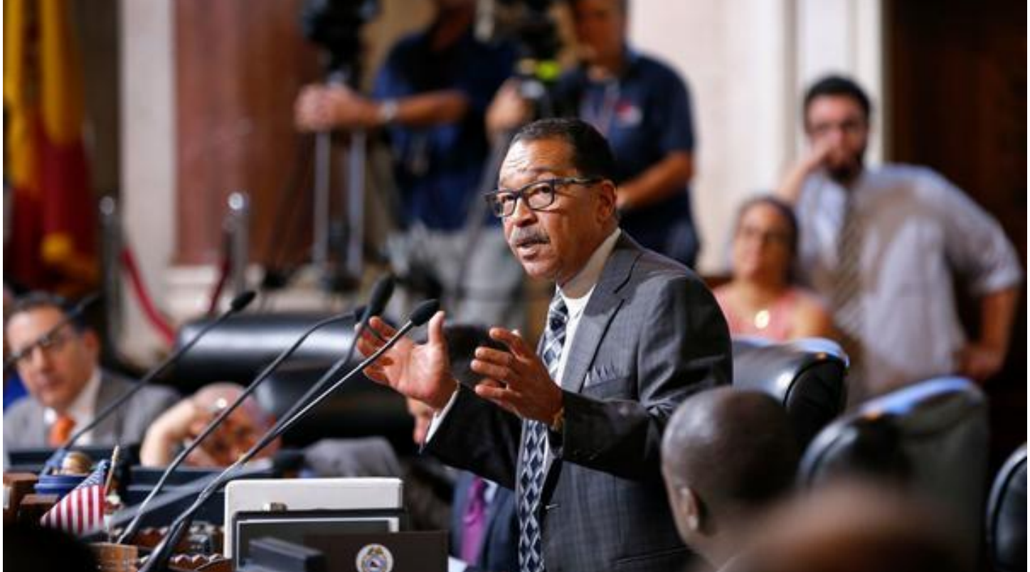
City Council President Herb Wesson speaks at Los Angeles City Hall last month.

http://www.latimes.com/local/lanow/la-me-ln-wesson-speech-20170725-story.html