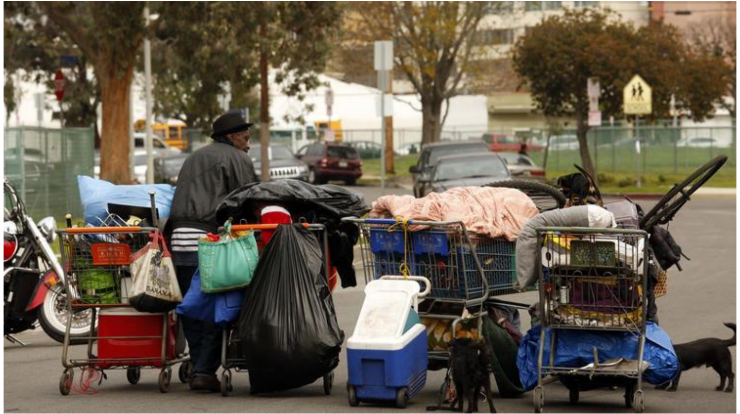
Mirroring last year's count, only one of every four homeless people were classified as "sheltered," meaning they were counted in an emergency shelter or longer-term transitional program. That left three of every four — just under 43,000 — living on the street.

The only hopeful sign of homeless initiatives making headway was the strong increase in the number of homeless families being sheltered. Though the population of homeless families increased nearly 30%, those without shelter dropped 21%.