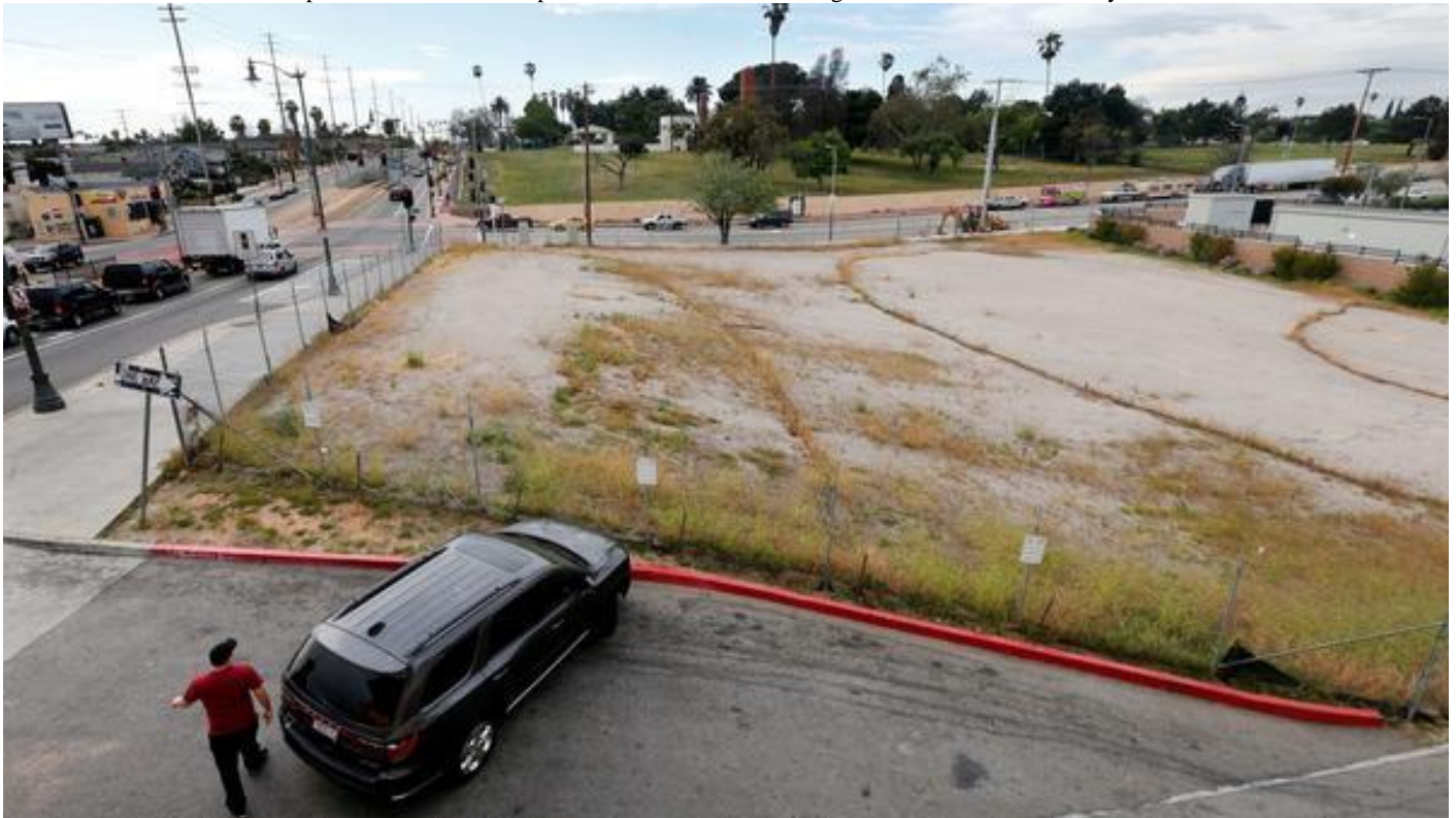
An empty lot, located at the intersection of 1st St. and Lorena St. in Boyle Heights on April 6. A nonprofit developer's plan to build housing for the homeless here has been stalled.

http://www.latimes.com/opinion/editorials/la-ed-housing-crisis-bills-20170527-story.html