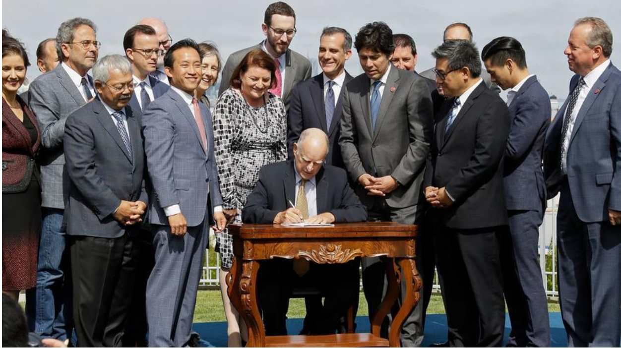
Gov. Jerry Brown signs bills to help address housing needs on Sept. 29, 2017 in San Francisco.

http://www.latimes.com/politics/la-pol-ca-housing-legislation-signed-20170929-htlstory.html