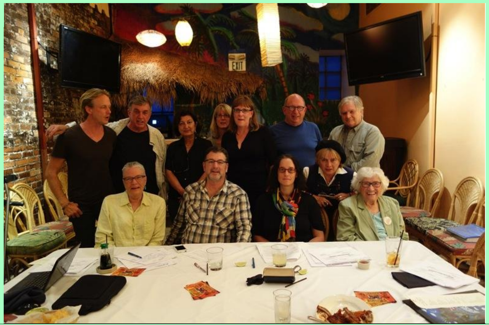
It's YOUR Venice Neighborhood Council Vision Goals - get involved!

Mission: Provide a monthly forum for discussion of long-term matters affecting the <u>Venice Community</u> within the context of the <u>VNC Vision Goals</u>. Action: These ↓ individuals generated the <u>VNC Vision Goals Idea Matrix</u>.