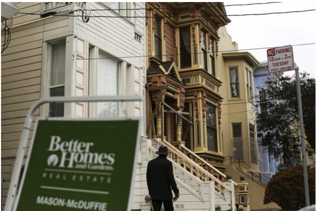
A real estate sign is seen near a row of homes in the Haight Ashbury neighborhood in San Francisco.

Regardless of these realities, most San Francisco progressives chose to stick with their familiar stance of opposing new development, positioning themselves as defenders of the city’s physical character. Instead of forming a pro-growth coalition with business and labor, most of the San Francisco Left made an enduring alliance with home-owning NIMBYs. It became one of the peculiar features of San Francisco that exclusionary housing politics got labeled “progressive.” (Organized labor remained a major political force throughout this time period, and has allied with both pro-growth and anti-growth forces, depending on the issue.) Over the years, these anti-development sentiments were translated into restrictive zoning, the most cumbersome planning and building approval process in the country, and all kinds of laws and rules that make it uniquely difficult, time-consuming, and expensive to add housing in San Francisco .