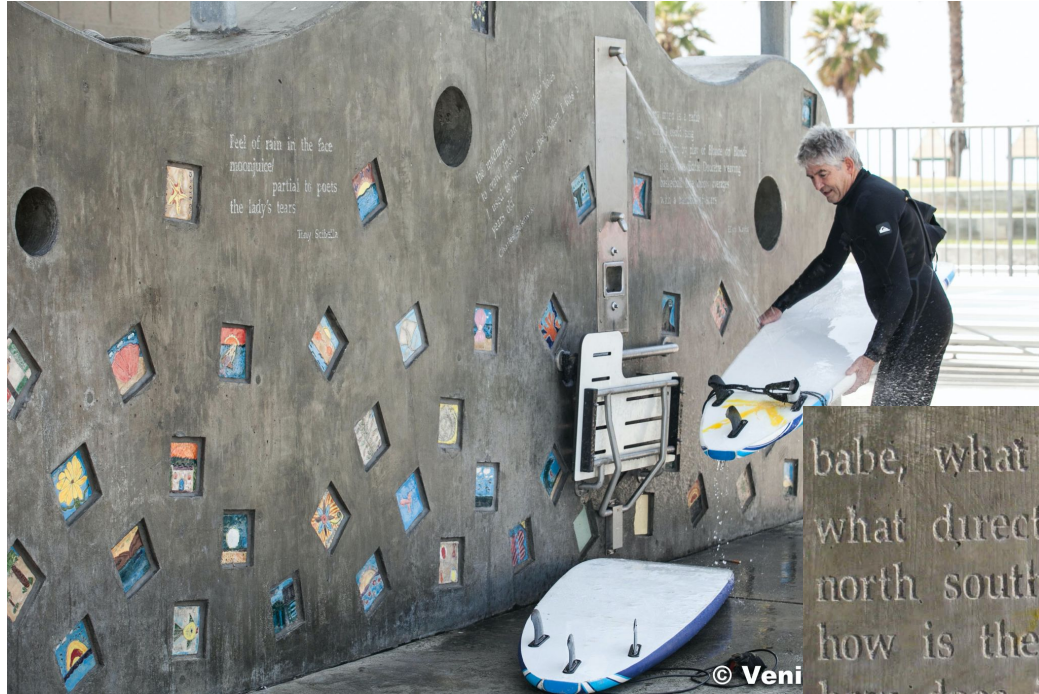
Children's Visual Poetry Art Tiles