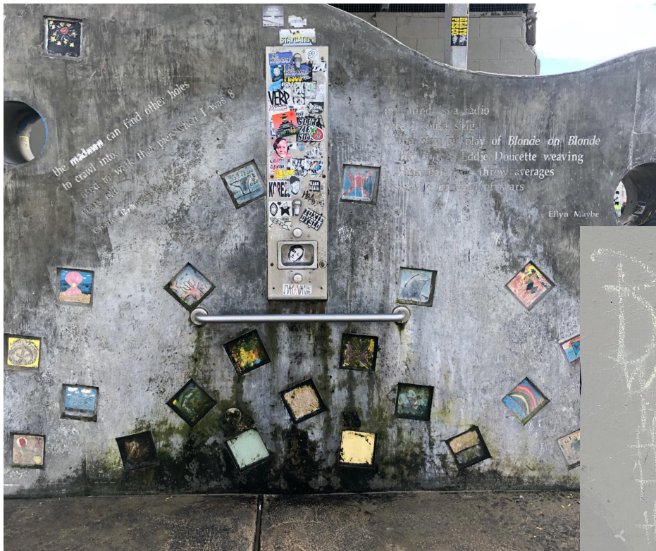
Children's Visual Poetry Art Tiles

my mind is a radio and you are the play of Blonde on Blonde the voice of Eddie Doucette weaving through the throw averages of a million of stars