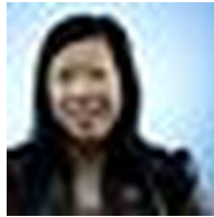
By ANH DO FEB 14, 2018

http://www.latimes.com/local/lanow/la-me-oc-homeless-judge-20180214-story.html