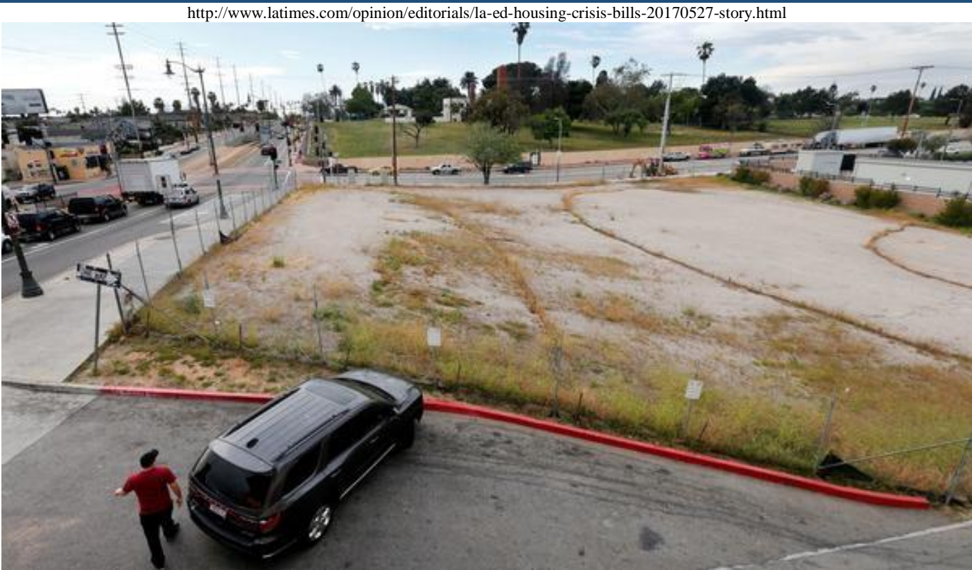
An empty lot, located at the intersection of 1st St. and Lorena St. in Boyle Heights on April 6. A nonprofit developer's plan to build housing for the homeless here has been stalled. The Times Editorial Board