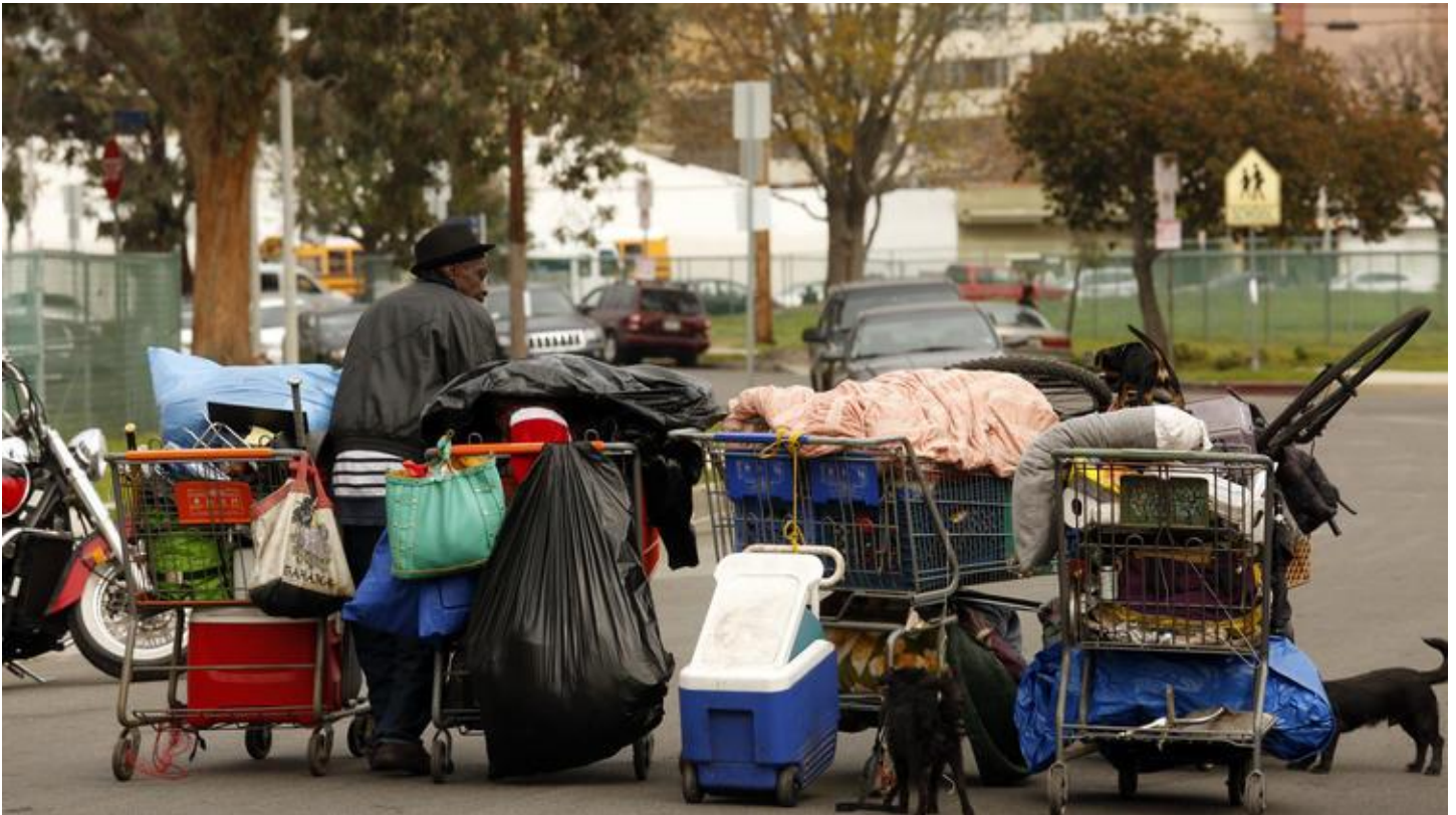
Mirroring last year's count, only one of every four homeless people were classified as "sheltered," meaning they were counted in an emergency shelter or longer-term transitional program. That left three of every four — just under 43,000 — living on the street.

The only hopeful sign of homeless initiatives making headway was the strong increase in the number of homeless families being sheltered. Though the population of homeless families increased nearly 30%, those without shelter dropped 21%.