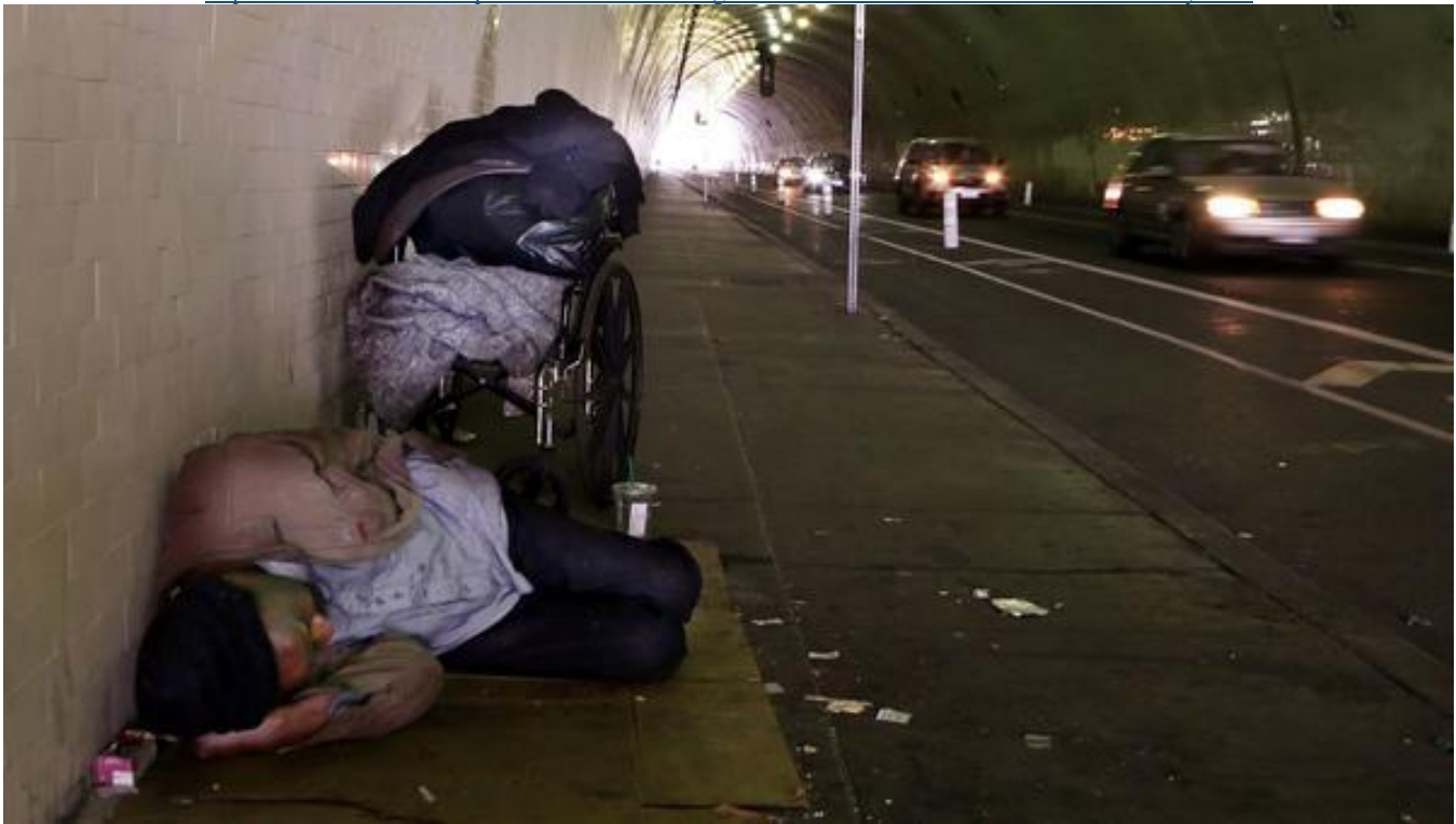
A man sleeps in the 2nd Street tunnel in downtown Los Angeles. Citywide, the homeless population jumped 23% over the last year.

http://www.latimes.com/opinion/editorials/la-ed-grim-2017-homeless-numbers-20170601-story.html