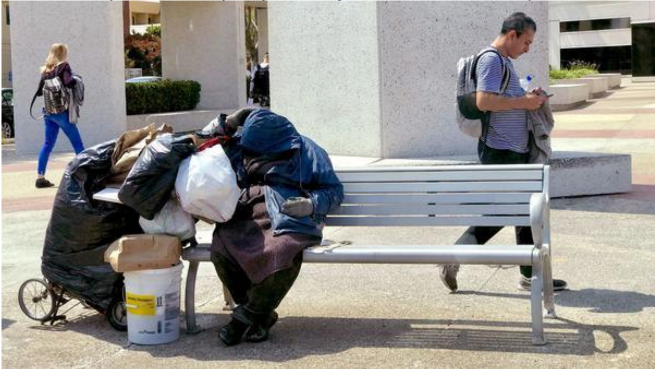
A homeless person sleeps on a bench on Wilshire Boulevard in Santa Monica.

http://www.latimes.com/opinion/opinion-la/la-ed-grim-homeless-numbers-20170530-story.html