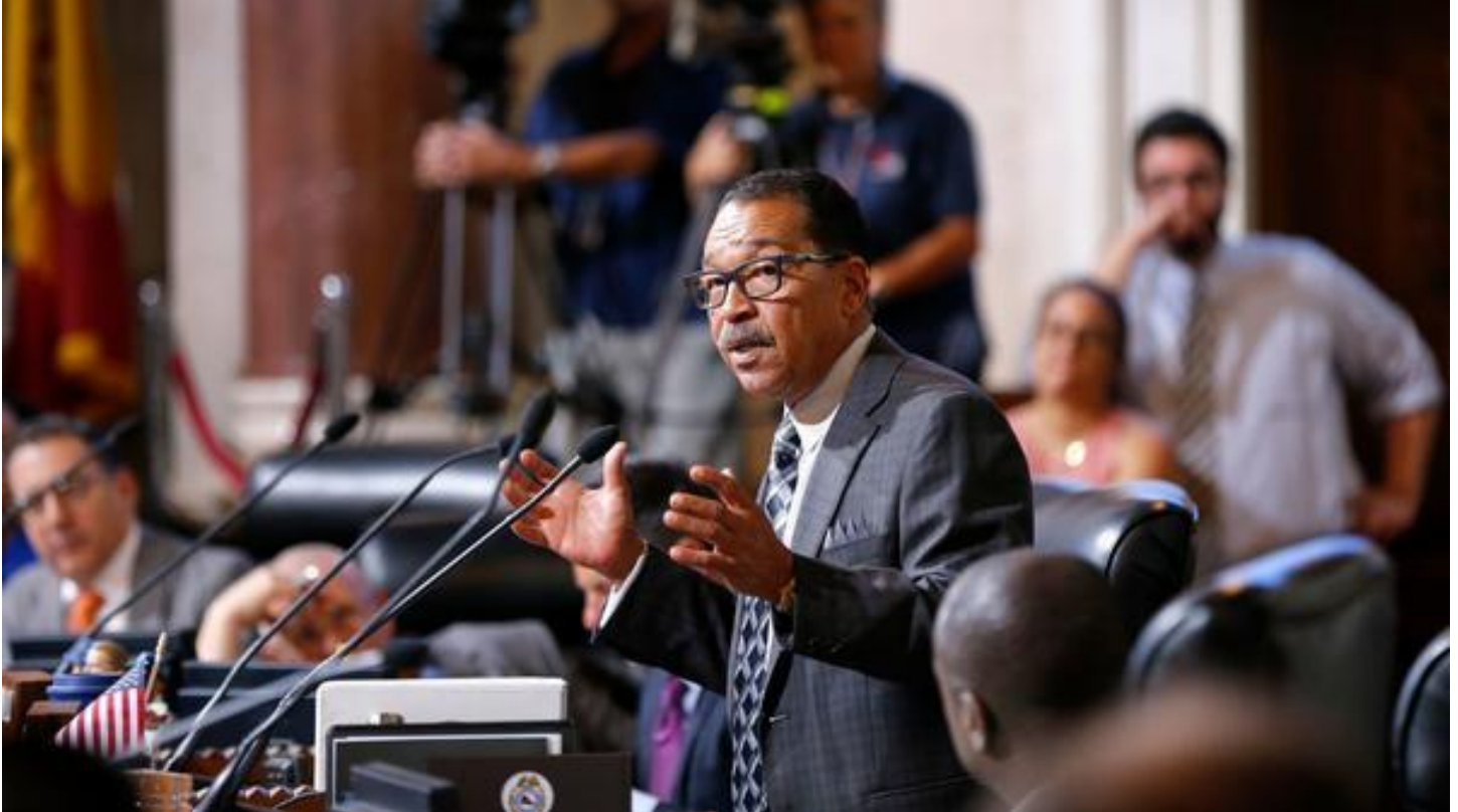
City Council President Herb Wesson speaks at Los Angeles City Hall last month.

http://www.latimes.com/local/lanow/la-me-ln-wesson-speech-20170725-story.html