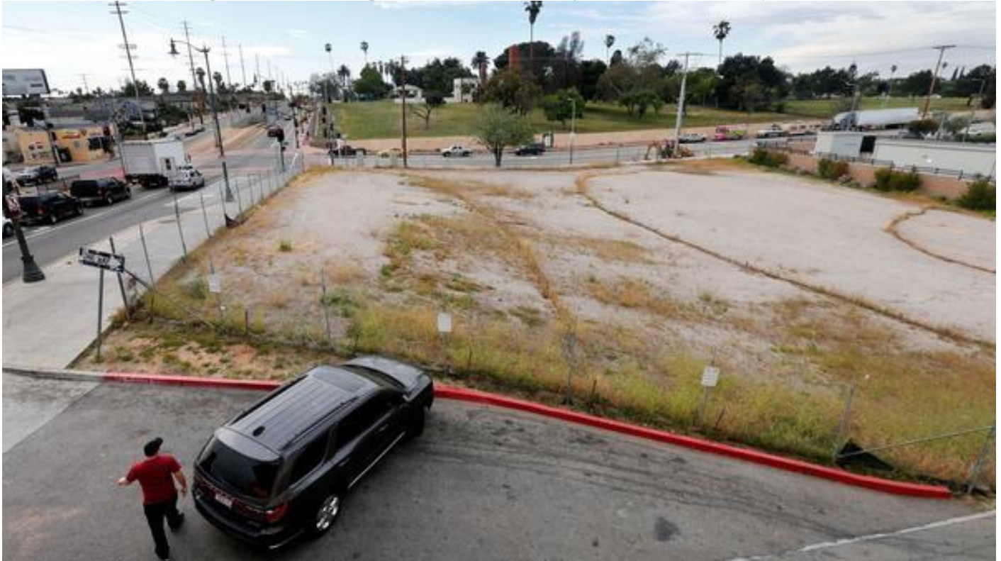
An empty lot, located at the intersection of 1st St. and Lorena St. in Boyle Heights on April 6. A nonprofit developer's plan to build housing for the homeless here has been stalled.

http://www.latimes.com/opinion/editorials/la-ed-housing-crisis-bills-20170527-story.html