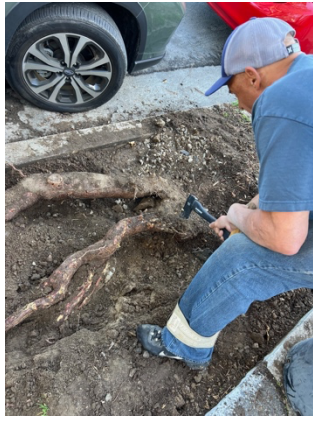
Digging out old buried tree root guards and tree roots