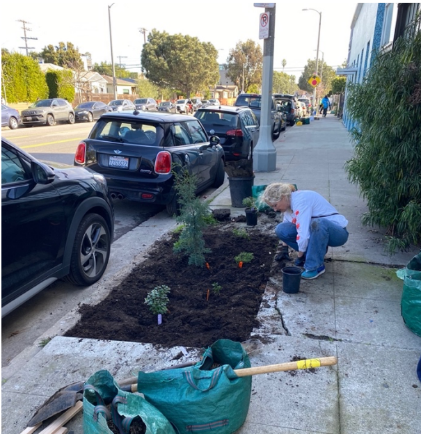
Increased treewell size by 200% from 4'x4' to 4'x8'