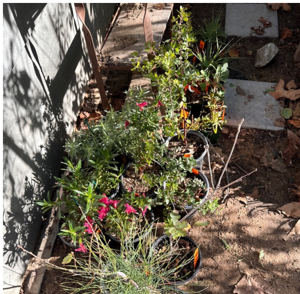
Added additional plants to support the trees