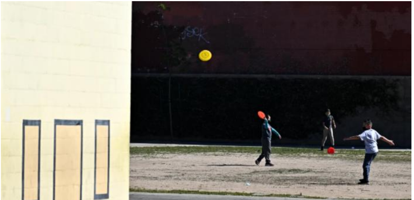
Kids play in an open field at Castellanos Elementary in Los Angeles, one of the only surfaces on campus that is not paved.

The experience is sadly typical of schools across Los Angeles, where too many children are forced to learn and play in paved-over, fenced-in and often treeless campuses that draw apt comparisons to prison yards or parking lots. These conditions are detrimental to learning, health and well-being, and especially harmful because they are so common in the same low-income communities of color that already suffer from a lack of tree canopy , park space and higher exposure to heat and pollution.