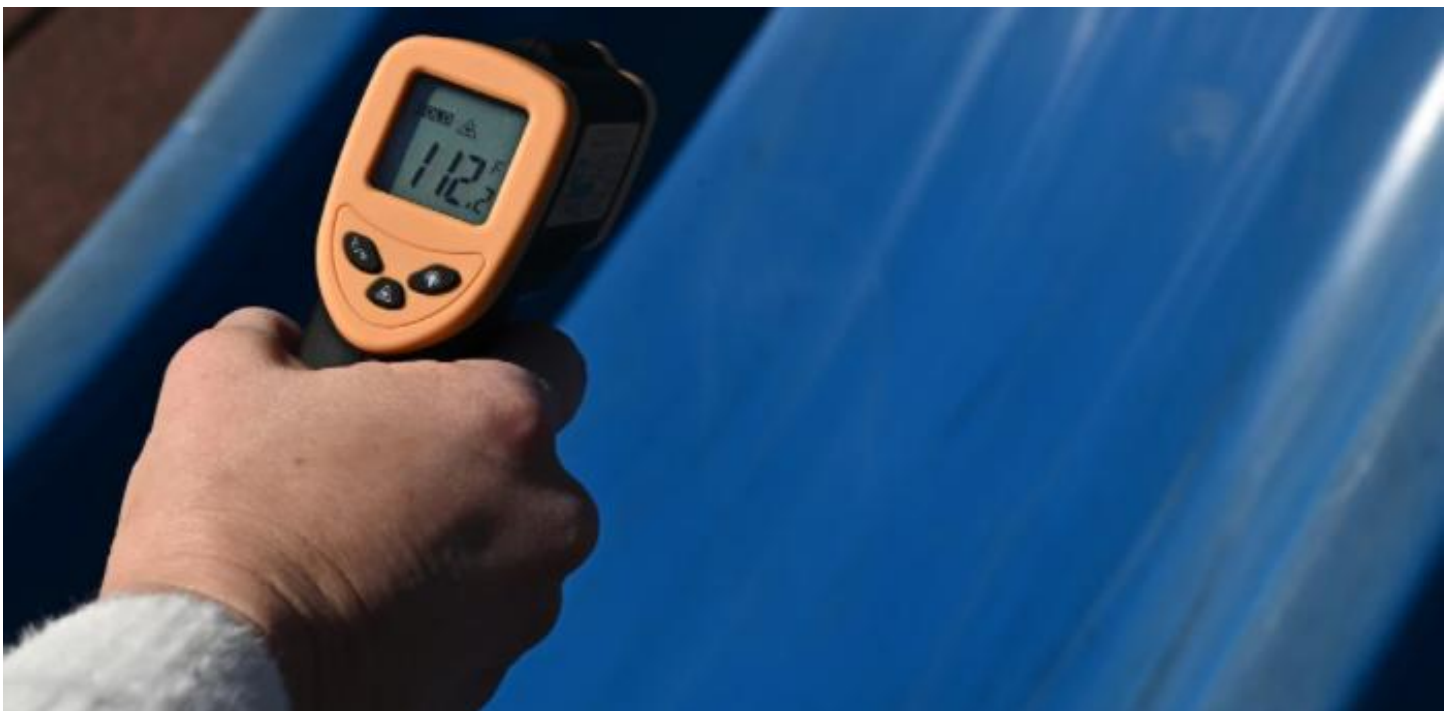
Robin Mark displays a 112-degree surface temperature reading on a slide at Castellanos Elementary in Los Angeles. Students sometimes have to be kept inside because of the heat and lack of shade.

L.A.’s schoolyards are contributing to the heat island effect, in which neighborhoods with few trees and a lot of paved, heat-absorbing surfaces — where Asian, Black and Latino residents are more likely to live — can be 10 degrees higher than surrounding areas . Though global warming is amplifying those disparities, they are the product of decades of discriminatory policies, including environmental racism and historical redlining, that excluded communities of color from real estate investment, parks and open space while saddling them with polluting industries.