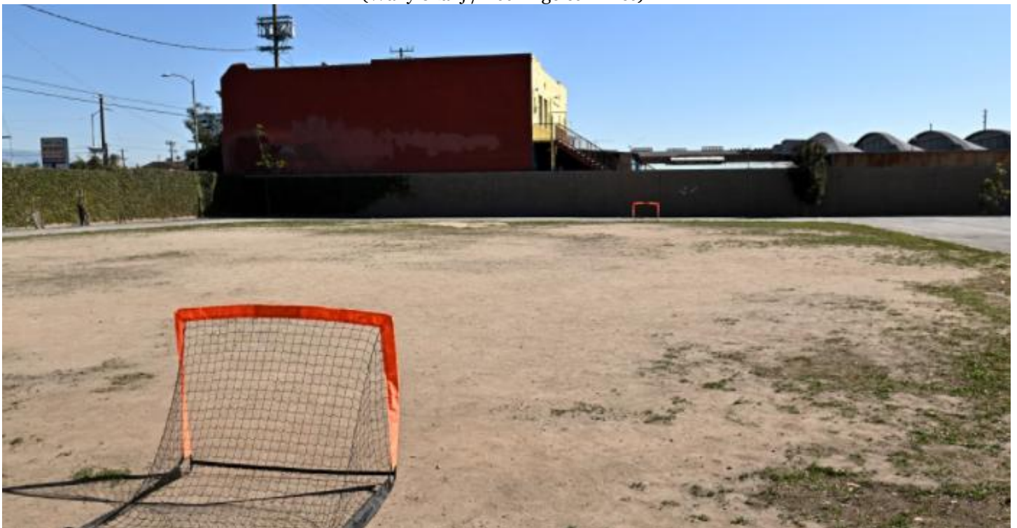
A play area at Castellanos Elementary in Los Angeles that lacks a working sprinkler system.