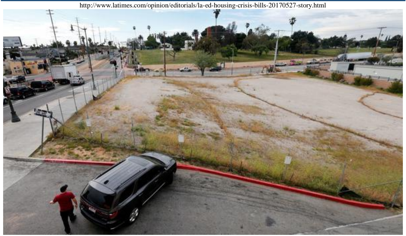
An empty lot, located at the intersection of 1st St. and Lorena St. in Boyle Heights on April 6. A nonprofit developer's plan to build housing for the homeless here has been stalled.

(Los Angeles Times) The Times Editorial Board