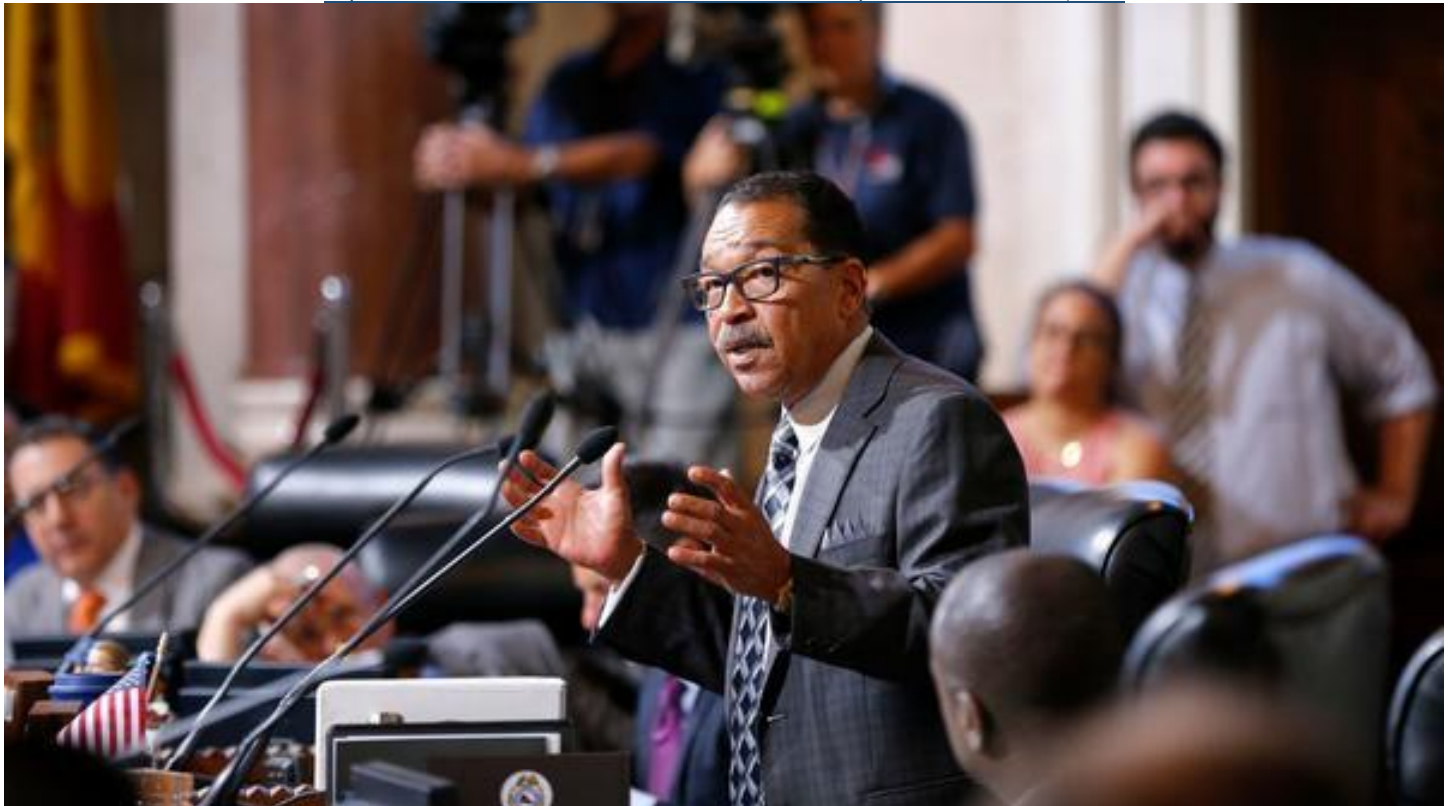
City Council President Herb Wesson speaks at Los Angeles City Hall last month.

http://www.latimes.com/local/lanow/la-me-ln-wesson-speech-20170725-story.html