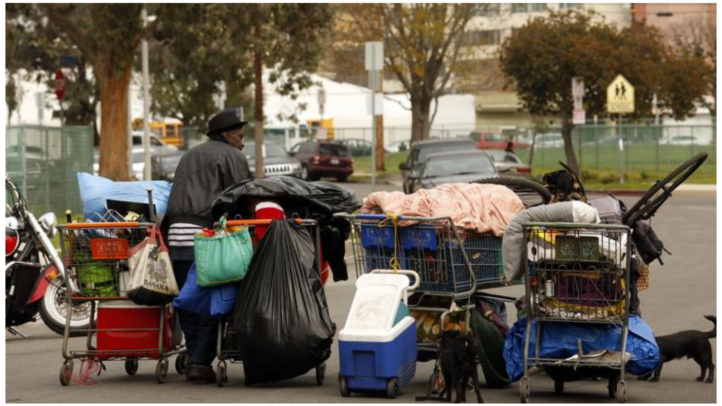
Mirroring last year's count, only one of every four homeless people were classified as "sheltered," meaning they were counted in an emergency shelter or longer-term transitional program. That left three of every four — just under 43,000 — living on the street.

The only hopeful sign of homeless initiatives making headway was the strong increase in the number of homeless families being sheltered. Though the population of homeless families increased nearly 30%, those without shelter dropped 21%.