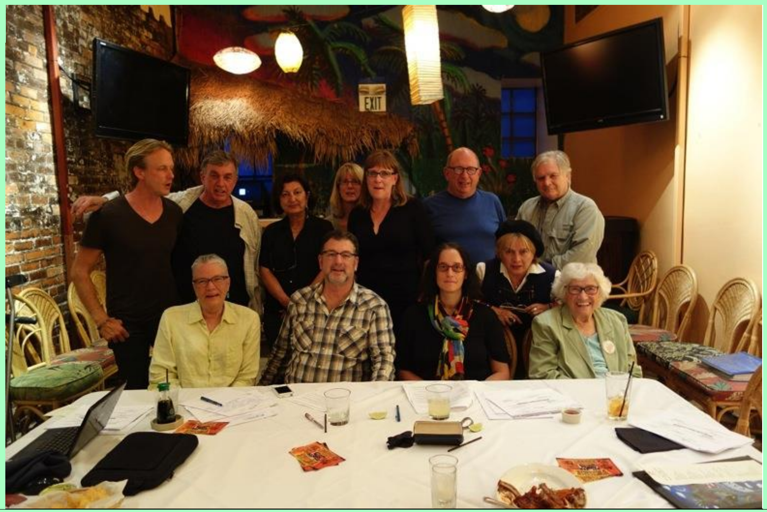
It's YOUR Venice Neighborhood Council <u>Vision Goals</u> - get involved!

<u>Mission</u>: Provide a monthly forum for discussion of long-term matters affecting the <u>Venice Community</u> within the context of the <u>VNC Vision Goals</u>. Action: These \psi individuals generated the <u>VNC Vision Goals</u> Idea Matrix.